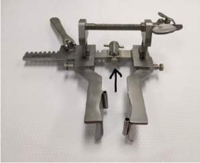
Remove "U" shape locking clip