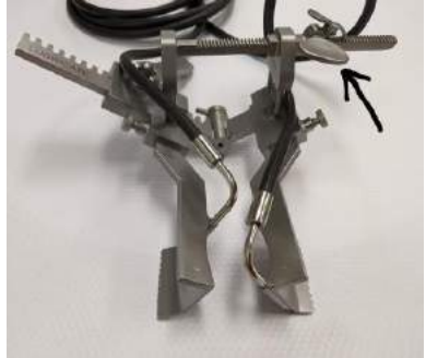
Thumb screw on lifting tower