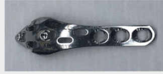
Cobra Head, 3 hole Cat # KCI-609W.03