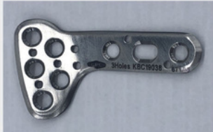
Volar Plate, Right, 5 hole small Cat # KCI-675.03R