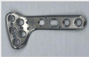
Volar Plate, Right, 5 hole Cat # KCI-675.04R