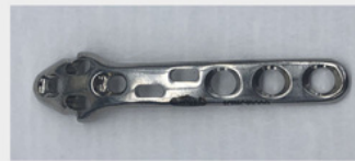
Cobra Head Narrow, 3 hole Cat # KCI-609N.03