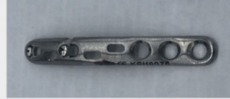
Dorsal/Ulnar 3 hole Curved Cat # KCI-674.03