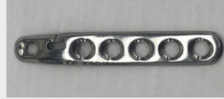
Dorsal/Ulnar 5 hole Straight Cat # KCI-641.05