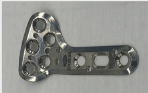
Volar Plate, Left, 5 hole small Cat # KCI-675.03L