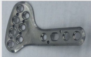
Volar Plate, Left, 7 hole Cat # KCI-676.04L