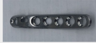
Dorsal/Ulnar 5 hole Curved Cat # KCI-614.05