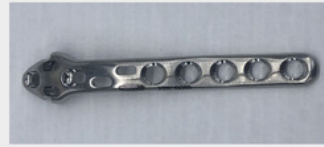
Cobra Head Narrow, 5 hole Cat # KCI-609N.05