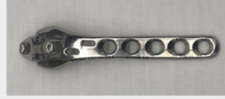
Cobra Head, 5 hole Cat # KCI-609W.05