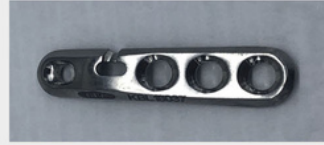
Dorsal/Ulnar 3 hole straight Cat # KCI-641.03