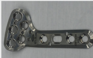
Volar Plate, Left, 5 hole Cat # KCI-675.04L