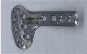
Volar Plate, Right, 7 hole Cat # KCI-676.04R